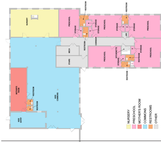
1st Floor Renovations