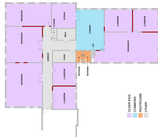
3rd Floor Renovations